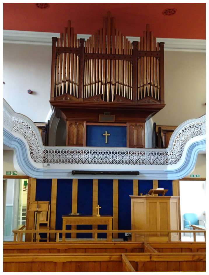
Wymondham Methodist Church

the opening page what I view to be a set of characteristics that are at the heart of what Methodism is and they are characteristics that can be found across the life of the District. For the sake of clarity I repeat those words here for they arise from my own particular journey of discipleship and my experience of being shaped by the Methodist tradition: