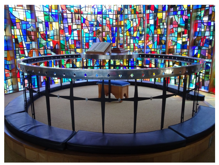
Sheringham Methodist Church

I am writing this introduction at a profoundly difficult time as we all face the stringent restrictions imposed in the light of the COVID-19 pandemic. Over the course of just a few weeks our whole way of life has been changed irrevocably and we are all having to adapt on a daily basis to the changes that are taking place. In response to this colleagues, both lay and ordained, are working incredibly hard to maintain our common life of faith, worship and pastoral care – admittedly this is happening in new and different ways! We are discovering the possibilities of online platforms for communication like