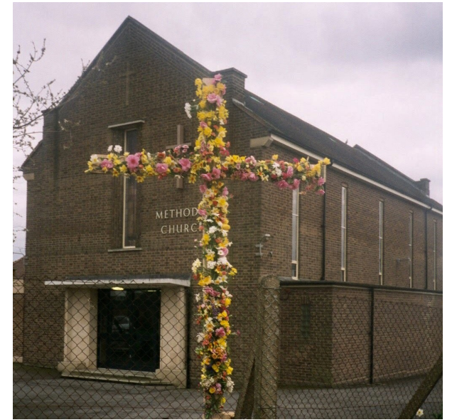
Walton Avenue Methodist Church, South Harrow

Their marriage gives an example of the accepting and forgiving nature of the Methodist Church that I have encountered.