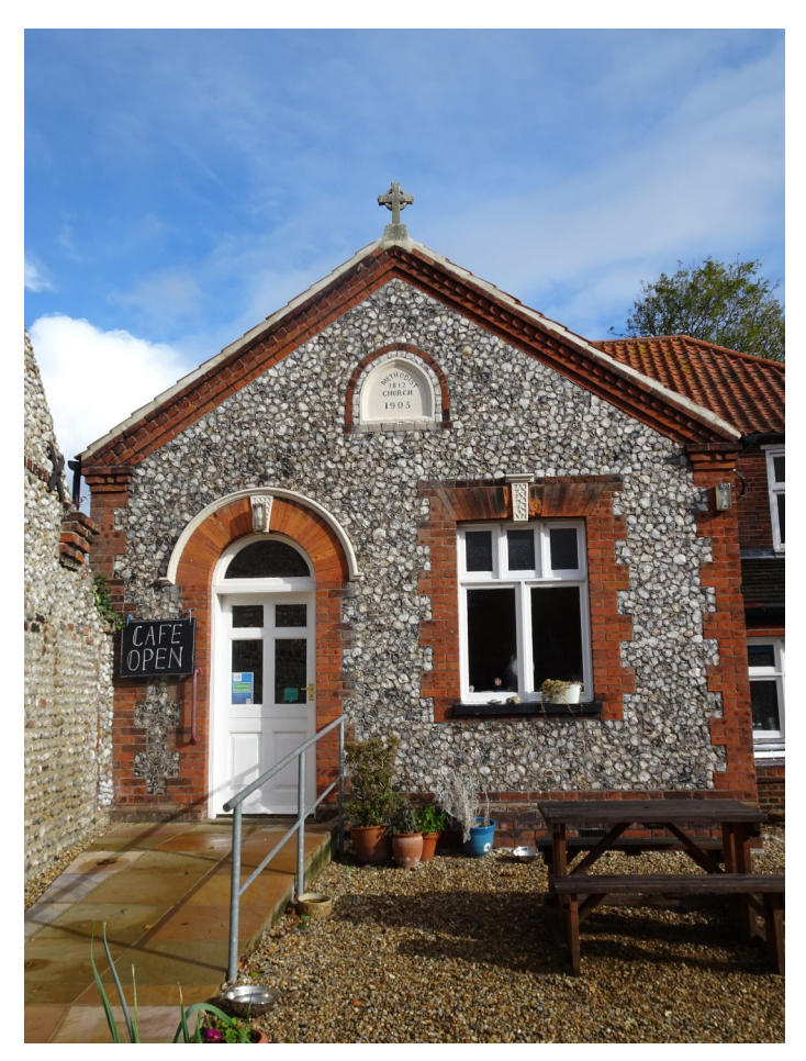
Blakeney Methodist Church