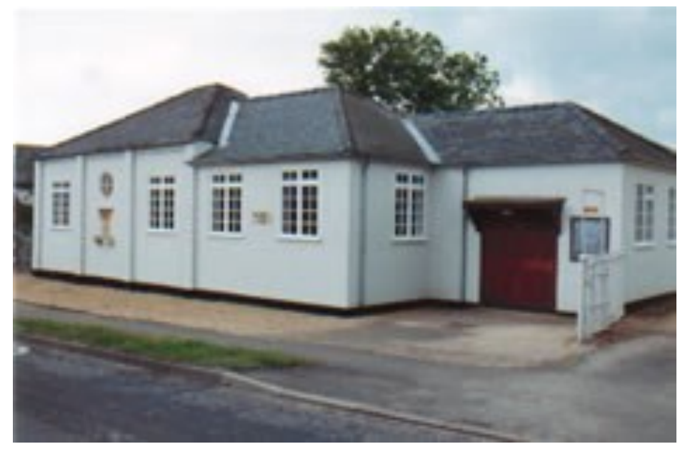
Toft Methodist Church as it appears on the East Anglia District website.

before I knew what the word meant! Our daughter was christened in an Anglican church, but at my wife's request we attended special services in the local Methodist church. It was during this time that my faith journey really began to take shape.