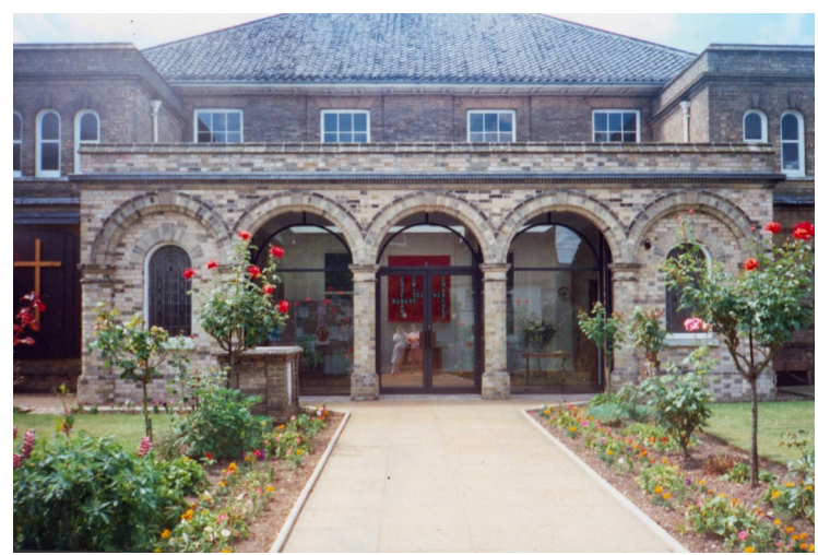
Bungay Emmanuel Church

In my early 30s, having finally left home