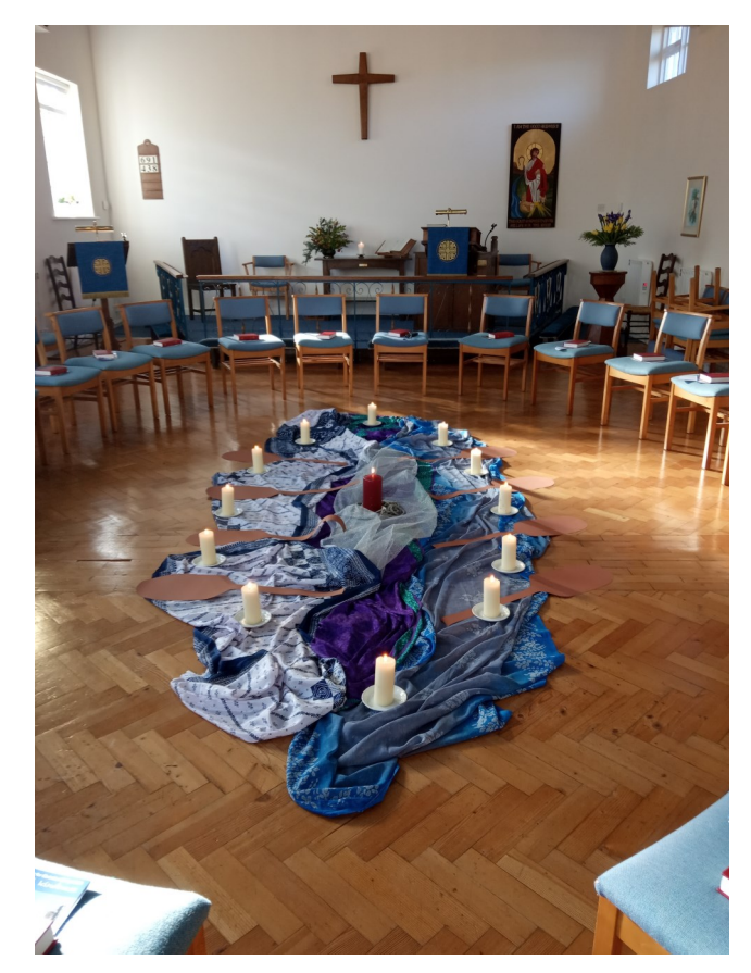
Service for the start of the Week of Prayer for Christian Unity at Toft Methodist Church.

From Methodism, therefore, I have gained much warmth and hospitality, a respect for academic study and a love of theology, open minded liberality about contemporary social issues, a spirit of