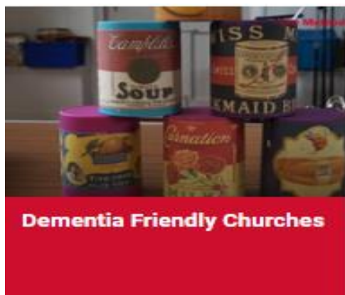
Dementia Friendly Churches

The new Advanced Module 2023 is being released at the beginning of next year and we will be piloting it at the North Walsham session on February 10 th . This means that when your AM is due for renewal, there will be some different material in the course.